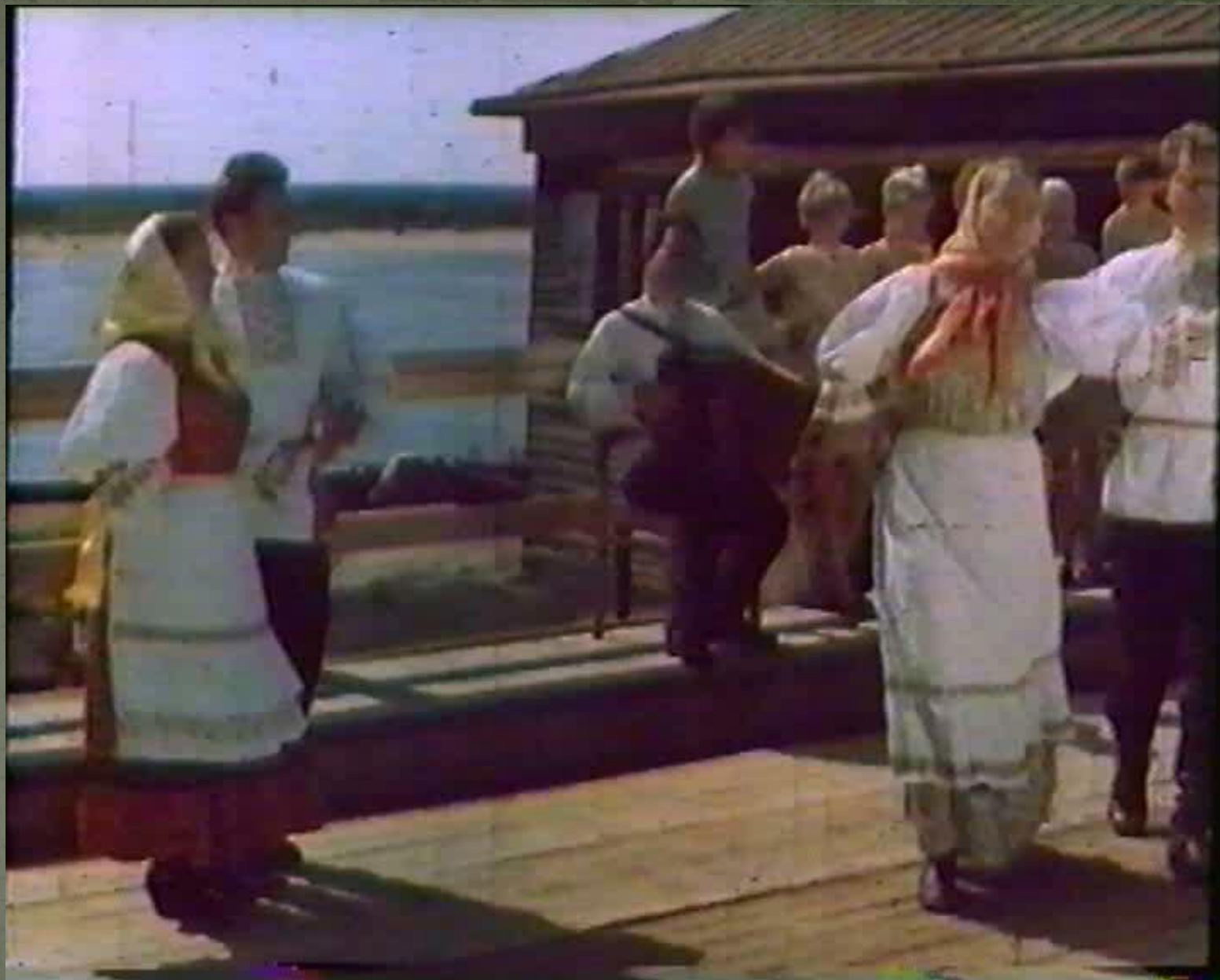
Quadrille «Vosmyora» («Eight») of the Arkhangelsk region