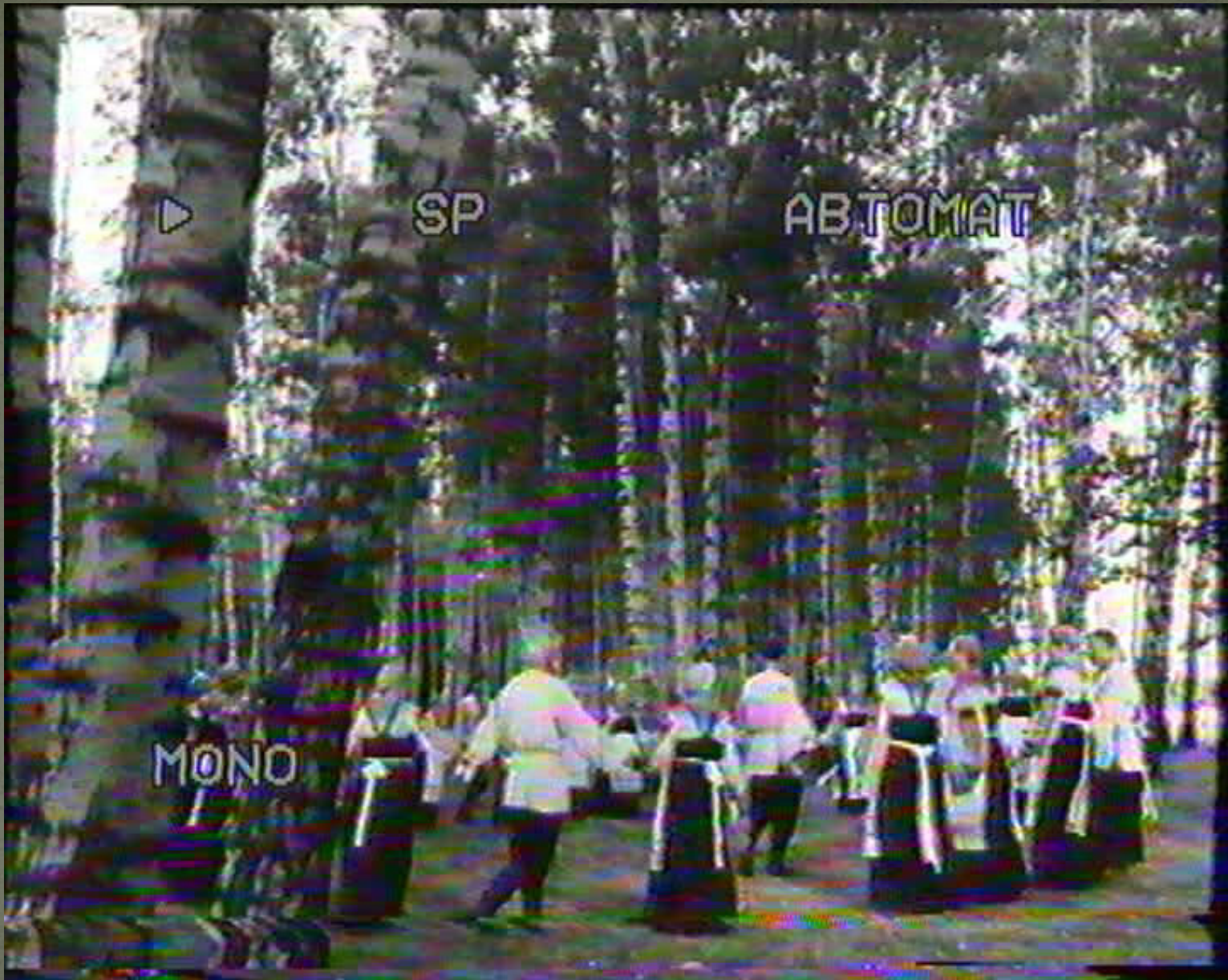
«Walked barin» - playing dance of the Tver region