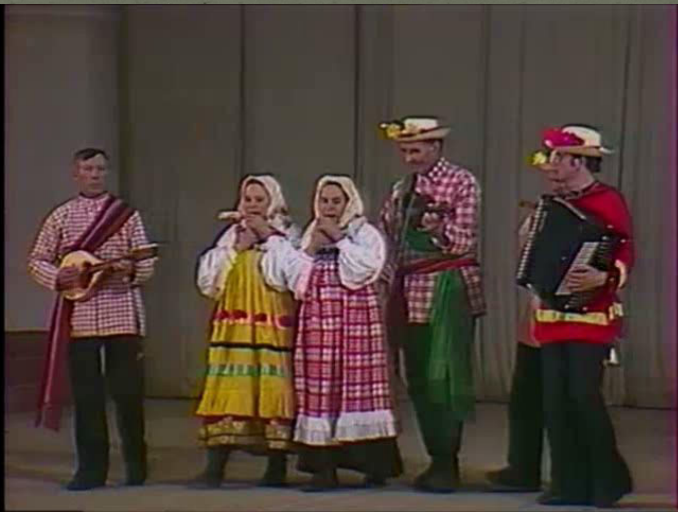
«Timonya» - karagod of the Kursk region