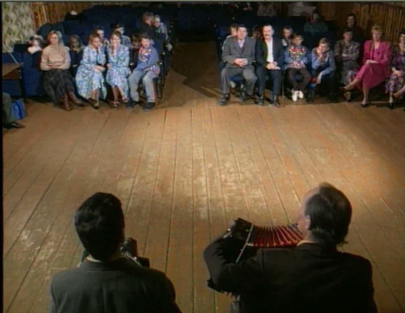
An example of improvisation - men's fling of the Kostroma region