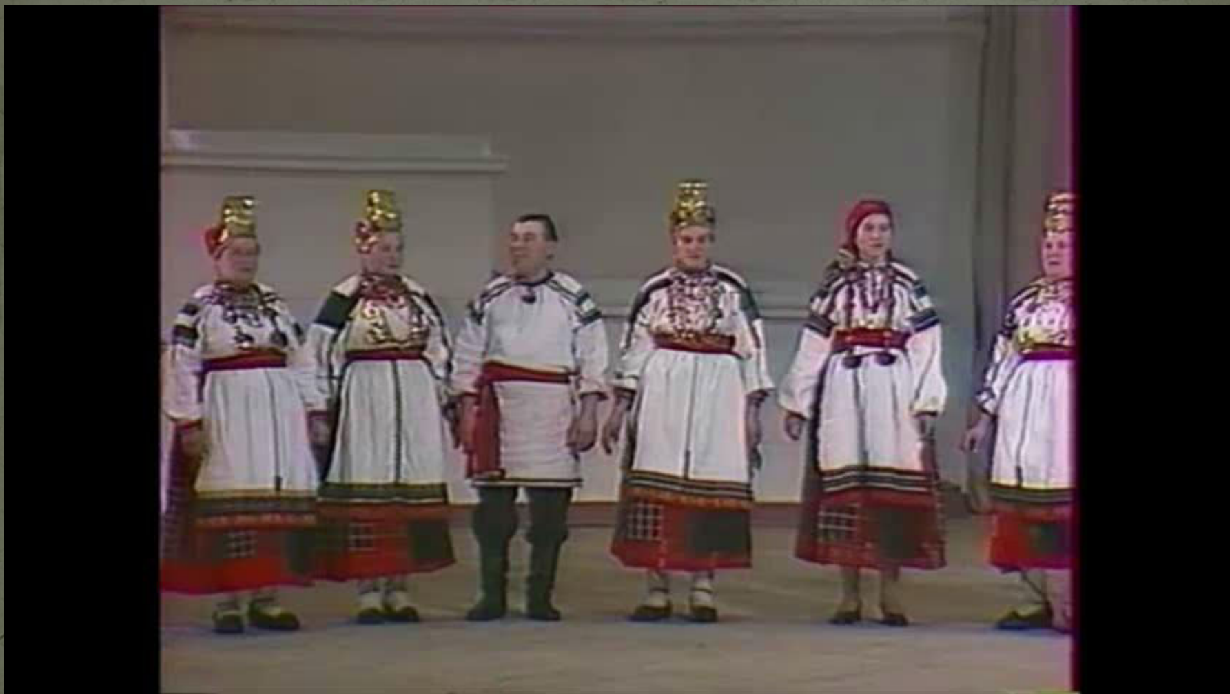
An example of polyrhythm - “peresek” of the Belgorod region